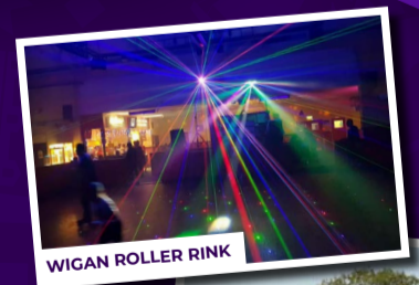
WIGAN ROLLER RINK

To find out more things to do in Wigan and Leigh, visit: www.visitwigan.com