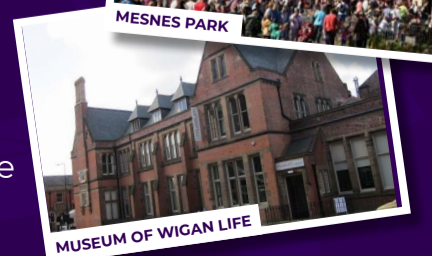
MUSEUM OF WIGAN LIFE